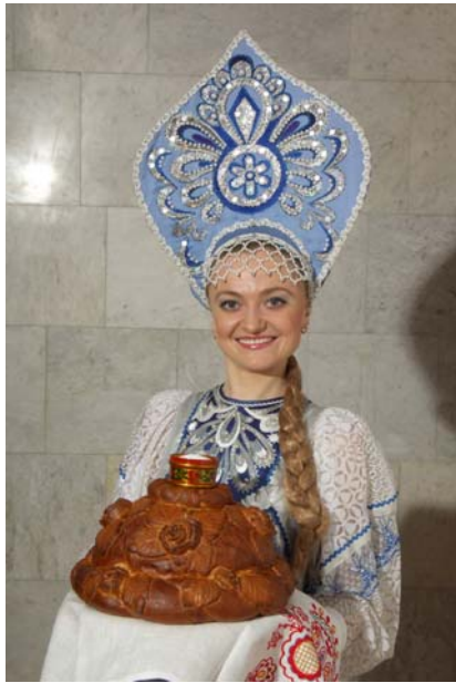
Sign of Welcome in Russia, Bread and Salt