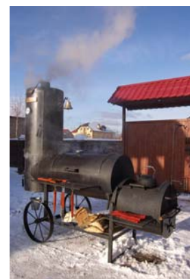
Russian Smoker, Typ "Smoky Harry"